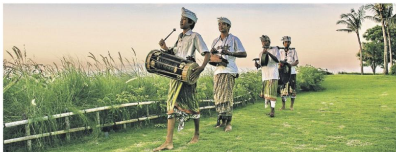
An exotic culture is one of the many attractions Bali offers couples planning to wed.