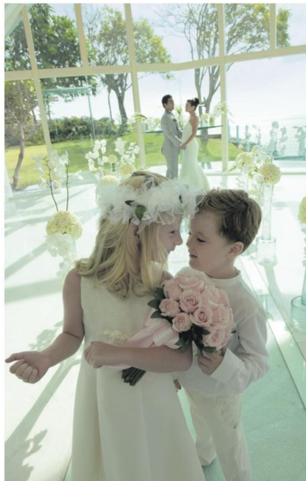
Weddings can be secular, religious or traditional Balinese in style.