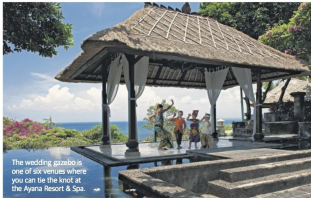
The wedding gazebo is one of six venues where you can tie the knot at the Ayana Resort & Spa.