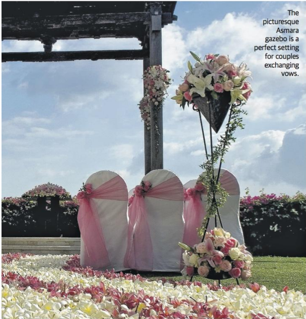
The picturesque Asmara gazebo is a perfect setting for couples exchanging vows.