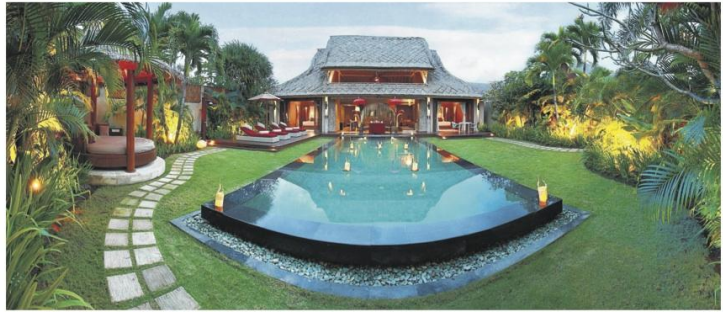
Space at Bali Villas in Seminyak combines a romantic wedding venue with expert staff.

"We fit the bride and groom in traditional dress and invite a symbolic Hindu priest and, of course, the wedding procession with 11 flower girls and all the